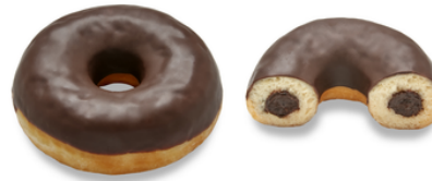
80209 Filled Cacao Dots 36 u / 68 g / 30' Thaw / 9,5 cm