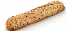
22285 Multiseeded Sandwich Baguette

52 u / 135 g / 15-20' Thaw 190-210° / 15-20' Oven / 26,5 cm