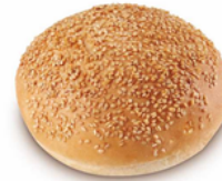
69813 Sesame burger Bun (Precut)