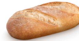
20011 GR Classic Country Loaf

Clean Label / Sourdough / Vegan / 100% Natural