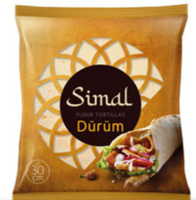
47893 Sinal Tortilla wheat 6x18u / 30 cm / 1440 g