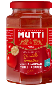
MUT64422 Mutti Pizzutello Tomato & Chili