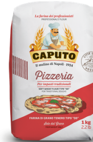
CAPP1 CAPUTO "00" PIZZERIA FLOUR

PROTEIN: 11% BAKERY: W 200 / 220 ELASTICITY: P/L 0,60 / 0,70