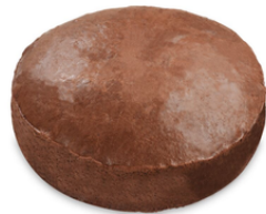
4644 Chocolate Sponge 200mm 24 u / 275 g / -18° Frozen