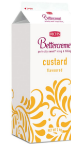
13527 Custard Bettercreme 9 u / 2 kg / -18° Frozen