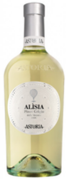
AST137 Pinot Grigio "Alisia" DOC 6 u / 750 ml