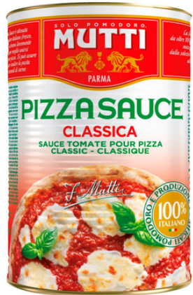
MUT65510 Pizza Sauce Classica 3 u / 4100 g