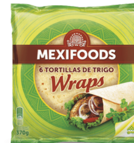
40116 Mexifoods Tortilla wheat 6x12u / 25 cm / 370 g