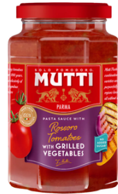
MUT64437 Mutti Rossoro Tomato & Grilled Vegetables