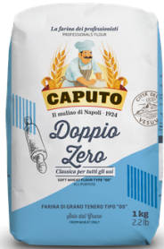
CAPCL1 CAPUTO "00" ALL-PURPOSE FLOUR