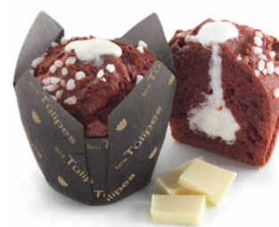
62840 RED VELVET TÛLIPE