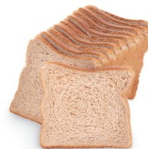
60850 Wheat Bran Frisandwich