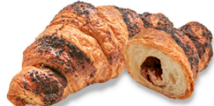
67460 Cocoa Croissant Sélection D'Or

64 u / 75 g / 20-30' Thaw 165-175° / 17-19' Oven / 14,5 cm