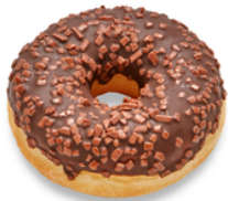
22026 Sprinkled Dots 36 u / 55 g / 20' Thaw / 9,5 cm