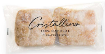
67322 Cristallino Ciabatta (28px2u)