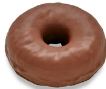
23100 Dark Dots 36 u / 60 g / 20' Thaw / 9,5 cm