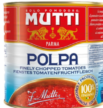
MUT41306 Polpa - Finely chopped Tomatoes 6u / 2500 g