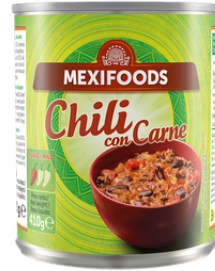
800246 Mexifoods Chili Con Carne 12 u / 410 g