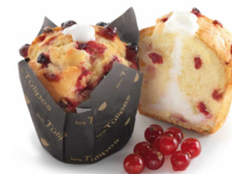
60770 CRANBERRY & YOGURT TÛLIPE