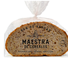
85102 Maestra Cereal Sourdough Loaf

Clean Label / Sourdough / Vegan / 100% Natural