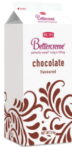
8495 Chocolate Bettercreme 9 u / 2 kg / -18° Frozen