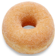
65760 Sugared Dots 36 u / 49 g / 20' Thaw / 9,5 cm