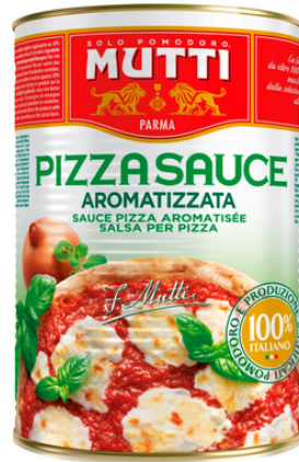
MUT65511 Pizza Sauce Aromatizzata 3 u / 4100 g