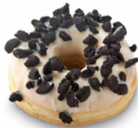
67126 Cookies Dots 36 u / 64 g / 20' Thaw / 9,5 cm