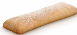
27950 Sandwich Ciabatta

Olive Oil / Clean Label / Sourdough 100% Natural / Vegan / Vegetarian