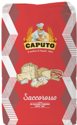
CAP25R CAPUTO "00" SACCOROSSO FLOUR

PROTEIN: 12.5% BAKERY: W 260 / 280 ELASTICITY: P/L 0,50 / 0,60