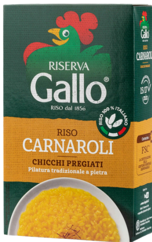
GAL001 Gallo Riso Riserva Carnaroli