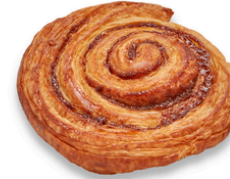
67220 Cinnamon Roll Sélection d'Or

48 u / 94 g / 20' Thaw 170° / 18' Oven / 14,5 cm