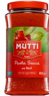
MUT64421 Mutti Rossoro Tomato & Genovese Basil