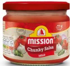
MF1004769 Mission Salsa Mexicana 6 u / 300 g