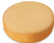
4641 Vanilla Sponge 200mm 24 u / 275 g / -18° Frozen