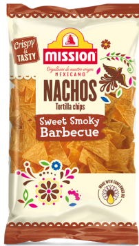
MF802613 Mission Nachos Chips BBQ 10 u / 175 g