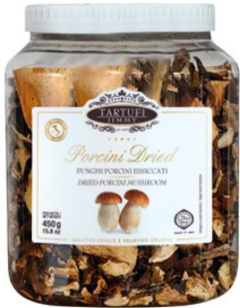
TJ-MDP450 Dried porcini mushrooms TJ 12 u / 450 g

Fragrant sliced dried porcini mushrooms, with an unmistakable aroma and taste. Excellent for risotto, pasta and as a decoration of your meat dishes. We recommend rinsing them and leaving them in cold water for 5-10 minutes before using them.