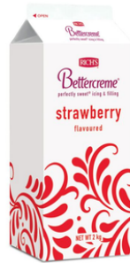
8507 Strawberry Bettercreme 9 u / 2 kg / -18° Frozen