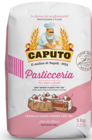
CAPPAS1 CAPUTO "00" PASTRY FLOUR

PROTEIN: 12% BAKERY: W 220 / 240 ELASTICITY: P/L 0,50 / 0,60