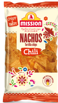
MF802595 Mission Nachos Chips Chili 10 u / 175 g