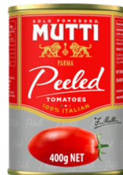
MUT52087 Pelati Whole peeled tomatoes