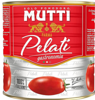
MUT51330 Pelati Peeled Tomato Gastronomia 6u / 2500 g