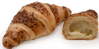
85962 Cheese Croissant

50 u / 90 g / 60' Thaw 165° 17' Oven / 13,5 cm