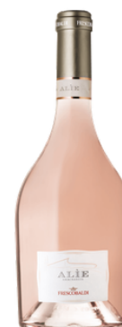
FRB004 Alie Rosé Ammiraglia 6 u / 750 ml