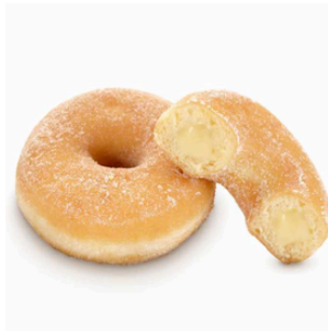
61293 Custard sugared Dots 36 u / 70 g / 30' Thaw / 9,3 cm