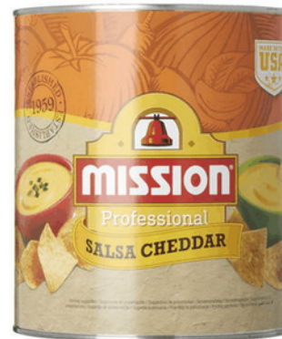
MF36110 Mission Salsa Queso (Food service) 6 u / 3000 g