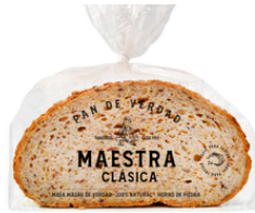
85101 Maestra Classic Sourdough Loaf