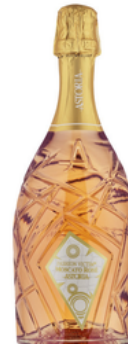
AST115 Fashion Victom Moscato Rosé 6 u / 750 ml