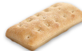
28880 Classic Panini (Pre-cut)

44 u / 130 g / 15-20' Thaw 180-190° / 12-16' Oven / 25 cm