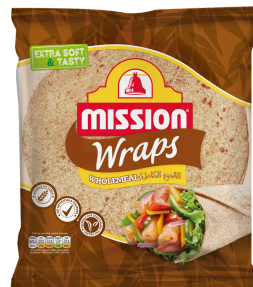
MF801858 Mission Tortilla Integrale 6x13u / 25 cm / 378 g