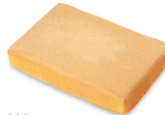
397 Vanilla Rectangular Sponge 16 u / 600 g / -18° Frozen