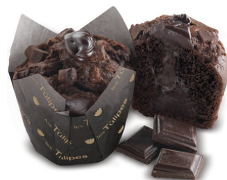
60930 COCOA EXTREME TÛLIPE