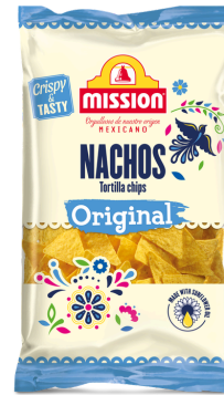
MF802593 Mission Nachos Chips Salted 10 u / 175 g