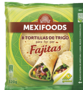
39999 Mexifoods Tortilla Wheat 8x12u / 20 cm / 320 g