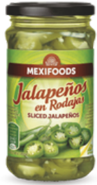
34593 Mexifoods sliced jalapeños 12 u / 225 g