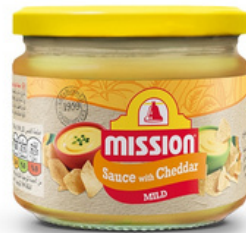
MF04768 Mission Salsa Queso 6 u / 300 g