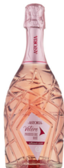
AST113 Prosecco Rosé "Velere" DOC 6 u / 750 ml