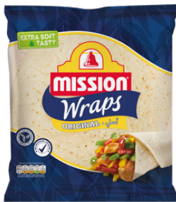
MF800010 Mission Tortilla wheat 8x12u / 20 cm / 320 g 801793 6x14u / 25 cm / 378 g