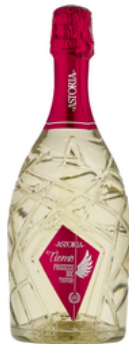
AST112 Prosecco Treviso Brut "Tieno" DOC 6 u / 750 ml