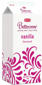
8500 Vanilla Bettercreme 9 u / 2 kg / -18° Frozen