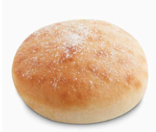
88833 Sourdough Burger Bun