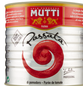
MUT61300 Passata - Tomato Purée 3u / 2500 g