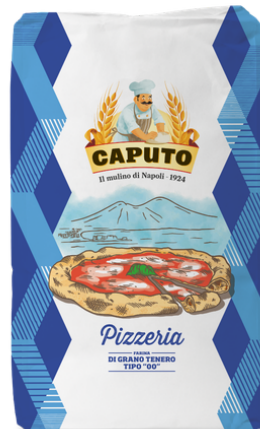
CAP25P CAPUTO "00" PIZZERIA FLOUR

PROTEIN: 13% BAKERY: W 300 / 320 ELASTICITY: P/L 0,50 / 0,60