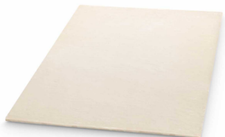
26810 Puff Pastry Sheet 60x40

16 u / 800 g / 15-20' Thaw 170-190° / 38,5 cm