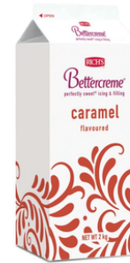
5677 Caramel Bettercreme 9 u / 2 kg / -18° Frozen