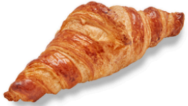
67420 Margarine Croissant Sélection D'Or

64 u / 75 g / 20-30' Thaw 165-175° / 17-19' Oven / 14,5 cm