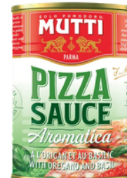
MUT65051 Pizza Sauce Aromatica