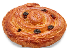
60131 Caprice Pain aux Raisins 40 u / 100 g / 10-15' Thaw 170-180' / 15-17' Oven / 11 cm