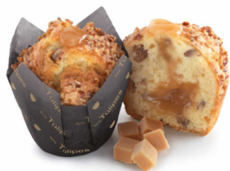
61980 CARAMEL & PECAN TÛLIPE

The fastest and easiest way to offer authentic American style muffins to your customers. Our ready-to-serve muffins have all the qualities and are perfect for businesses where a precise management of time and resources is a must