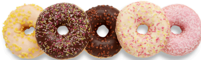
80640 Mix Box Dots (5 flavours) (5bx12u) / 58 g / 15-20' Thaw / 9,5 cm