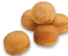
64210 Sugared Pop Dots 100u (1,2kg) / 13 g / 20' Thaw / 4,5 cm

SHOULD I OR SHOULDN'T I? DON'T HESITATE, JUST EAT ONE, OR TWO.