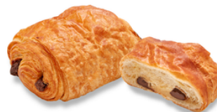
22175 Caprice pain au Chocolat 80 u / 70 g / 20-30' Thaw 170-180' / 18-20' Oven / 8 cm