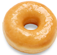
75511 Glazed Dots® 36 u / 52 g / 20' Thaw / 9,5 cm