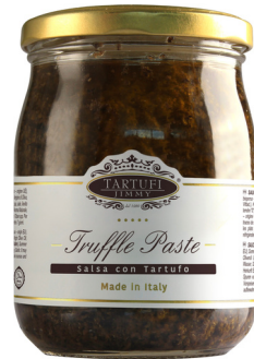
TJ-TP500 Truffle Paste 6 u / 500 g

Fragrant sliced dried porcini mushrooms, with an unmistakable aroma and taste. Excellent for risotto, pasta and as a decoration of your meat dishes. We recommend rinsing them and leaving them in cold water for 5-10 minutes before using them.