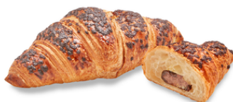
22080 Caprice Paris Croissant Chocolate 60 u / 70 g / 20-30' Thaw 170-180' / 15-20' Oven / 12 cm