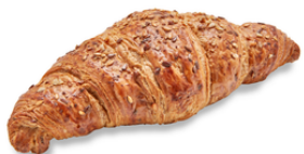
22180 Caprice Multicereal Croissant 55 u / 80 g / 20-30' Thaw 170-180' / 18-20' Oven / 14,5 cm