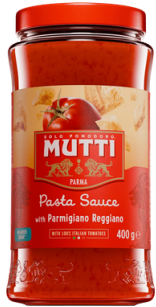
MUT64420 Mutti Rossoro Tomato & Parmigiano Reggiano