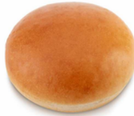
67943 Brioche Burger Bun

Olive Oil / Clean Label / Sourdough 100% Natural