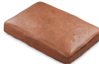
395 Chocolate rectangular Sponge 16 u / 600 g / -18° Frozen