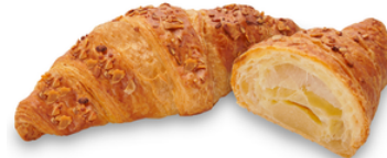
81195 Almond Croissant Sélection D'Or

48 u / 90 g / 20-30' Thaw 165-175° / 15-17' Oven / 14,5 cm