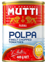
MUT41210 Polpa Finely chopped tomatoes