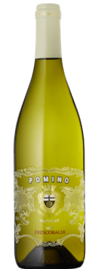
FRB012 Castello Pomino Bianco 6 u / 750 ml